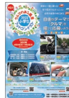
Car photo contest

KKC conducts seminars on topics of public concern, including topics such as how to prepare for and reduce the risks of dementia to realize a healthy aging society. A car photo contest for elementary school students is held in cooperation with the Japan Automobile Manufacturers Association, Inc. (JAMA), to heighten the younger generation's interest and awareness of cars and the future mobility society.