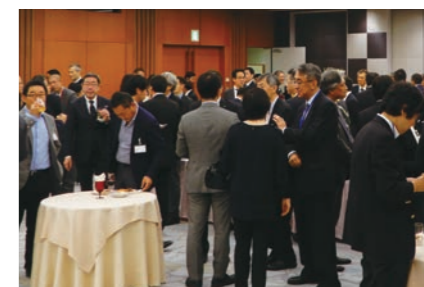
Reception for corporate and media representatives

KKC provides opportunities for corporate communications officers in member companies and organizations to interact with media executives, including business editors at leading newspaper companies, press agencies, and television channels, as well as chief editors of major business magazines.