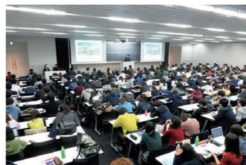
University lecture by a business executive

KKC arranges corporate executives and managers to serve as university lecturers, enabling students to gain a tangible understanding of the latest economic trends and industrial challenges.