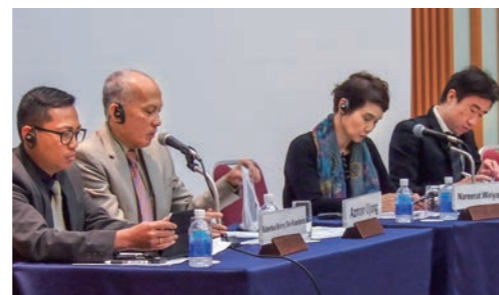
Discussion with ASEAN journalists

Journalists from ASEAN countries are invited to Japan for corporate visits and meetings with businesspeople, academics, and government officials.