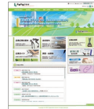
The Kigyo Koho Plaza website https://www.kkc.or.jp/plaza/