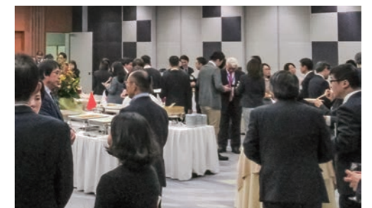
Reception with Chinese media representatives in Japan

KKC arranges receptions for Chinese news media in Japan and KKC member companies and organizations to strengthen the ties and communication among them.