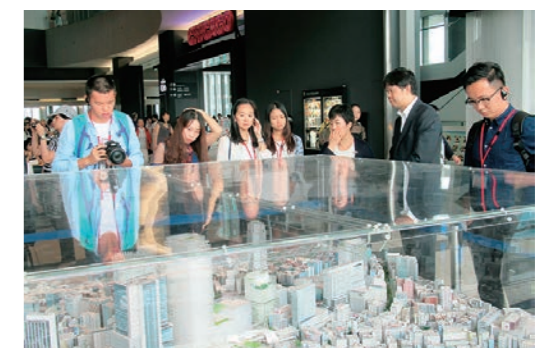
Company visit by university students from Guangdong, China

This program invites university students from China's Guangdong Province to Japan to deepen their knowledge of Japan's economy and corporate activities.