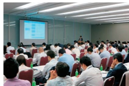
Lecture for newly appointed public relations personnel

KKC offers a range of programs and activities to support professionals in the corporate communications field. The corporate communications lecture series provides newcomers with learning opportunities in corporate communications principles and practices, while practical forums and social events for corporate communications professionals create opportunities for interpersonal networking. In addition, KKC's media training program offers practical media training for corporate communications executives.