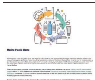
Marine Plastic Waste