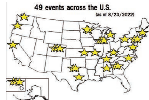
A map of past events of the Business Speaker Series