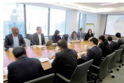
Company visit by delegation members to study corporate communications practices in the U.S.

KKC conducts surveys to identify changing trends that serve as a useful source of information on corporate awareness and understanding. Additionally, KKC organizes business delegations for advanced case studies on corporate communications trends in other countries.