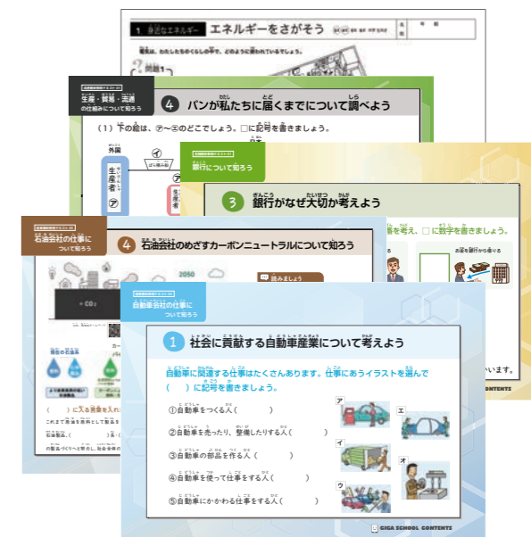
Supplementary teaching materials for elementary and middle school students