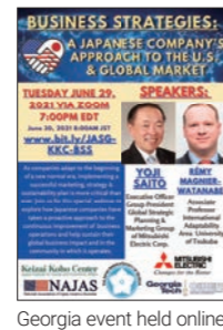
Georgia event held online

A series of events are held in various locations across the U.S. to provide opportunities for Japanese corporate executives to give presentations on their business strategies and contributions to local communities. At each event, participants are engaged in candid discussions to reinforce U.S.-Japan relations.