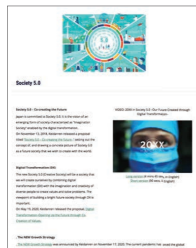
Commitment to Society 5.0