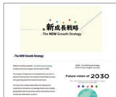
The NEW Growth Strategy