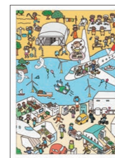
Picture book on SDGs