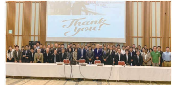
Meeting with the Ambassador of India to Japan

KKC arranges meetings for frank exchanges of views and opinions between executives of member companies and organizations and ambassadors to Japan from nations that have significant ties with Japan's business community.