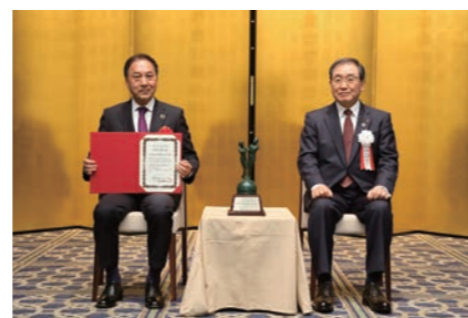
Corporate Communications Awards ceremony

KKC presents awards for outstanding accomplishments in the field of corporate communications. It encourages a deeper awareness of the importance of corporate communications and contributes to improvements in the quality and effectiveness of corporate communications activities.