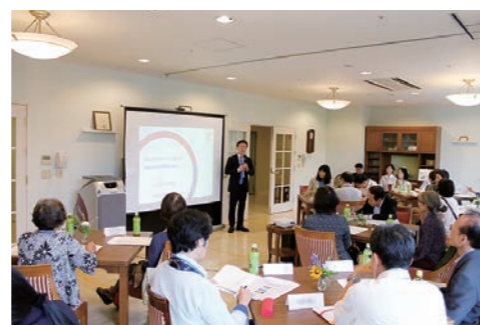
Exchanging views at a meeting with local citizens

KKC holds corporate town hall meetings as venues for the direct exchange of views and opinions by companies and members of the public. In addition, KKC offers tours of corporate museums and other corporate facilities to foster a deeper understanding of corporate operations.