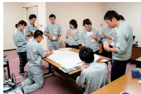
Business training for teachers

This program takes advantage of the summer vacation period to provide elementary and middle school teachers with a range of business training opportunities in corporate settings. Participants gain a deeper understanding of corporate practices and CSR activities.