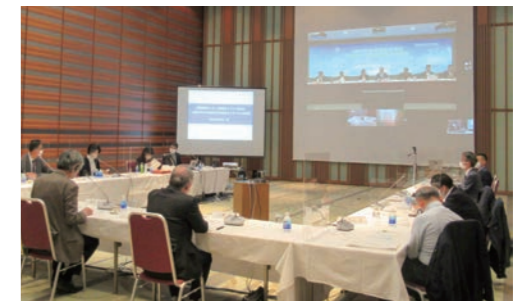
Online exchange with Shanghai media in 2020

KKC organizes a delegation to visit Shanghai to provide member companies and organizations with opportunities to exchange views with media and corporate representatives in Shanghai.