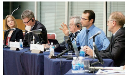
Panel discussion by European journalists

This program invites journalists and economic experts from the U.K., France, and Germany to Japan for opportunities to engage in dialogue with corporate executives, government officials, academics, and leading Japanese media.