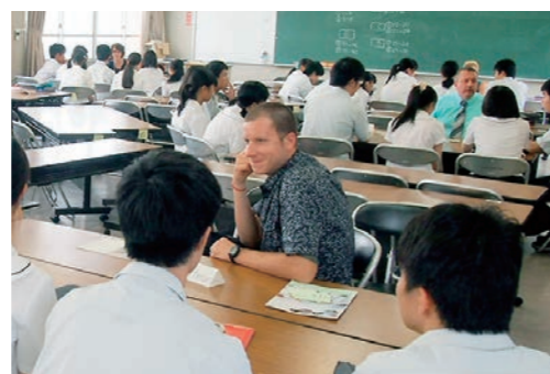
School visit by North American social studies teachers

This program invites middle and high school social studies teachers from the U.S. and Canada to Japan to provide them with a deeper understanding of Japan through visits to companies and schools and discussions on social and economic issues. After returning to their home country, participants make use of their experiences in their classrooms and community activities.